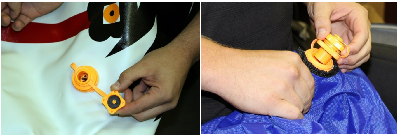
Figure 4 Figure 5 ONCE YOU HAVE THE FIRST VALVE HOOKED UP, LOCATE THE OTHER VALVE CONNECTION ON THE BACK OF THE PONY HOP AND REPEAT STEP 1

ONCE YOU HAVE ATTACHED THE VALVE TO THE VALVE LOCATION, SCREW IN YOUR AIR VALVE. MAKE SURE THERE IS NOTHING IN THE WAY OF YOUR BLACK ORINGS. ONCE YOU HAVE SCREWED IN YOUR AIR VALVE LOOSEN THE SMALLER CAP ON TOP OF THE AIR VALVE AS SHOWN IN FIGURE 4 BELOW