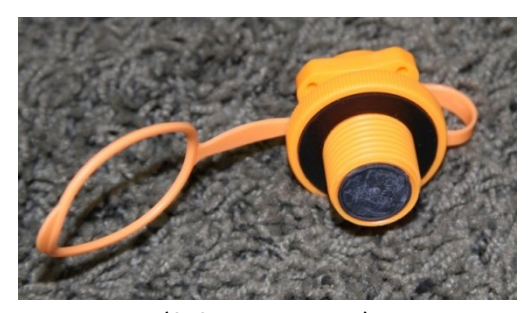
(Colors May Vary)

THESE AIR VALVES ARE "NO-LEAK, NO-OVERINFLATION" VALVES MEANING IF YOU USE THE PROPER PONY HOP INFLATOR YOU CAN NOT OVER INFLATE. AIR COMPRESSORS CAN CAUSE OVER INFLATION. WE DO NOT RECOMMEND USING AIR COMPRESSORS.