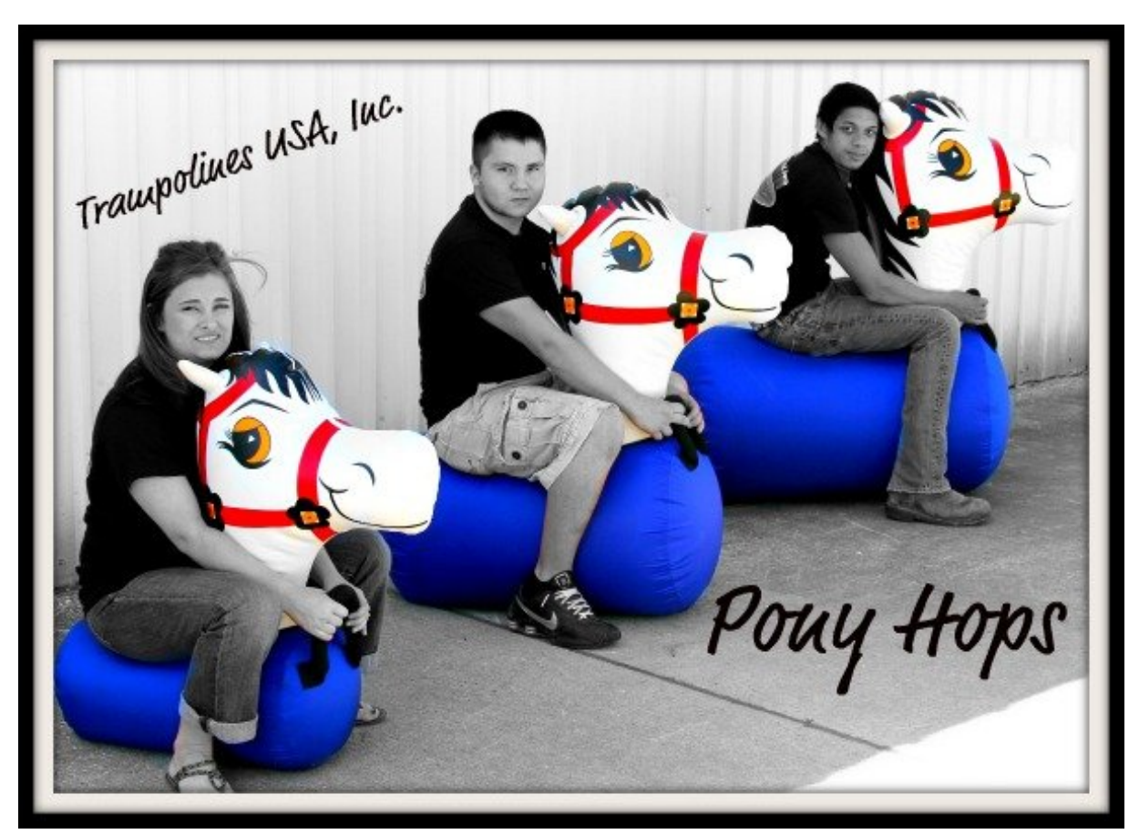
Enjoy your Pony Hops!!

Warranty repair work will be provided by Trampolines USA. Warranty will be null and void if any modifications and repairs are performed at an unauthorized inflatable repair company at any time. Return shipping will be at the expense of the product owner and will be refunded if unit meets warranty guidelines