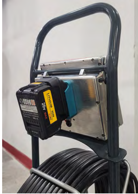
Dewalt with adapter