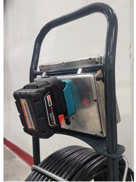
Milwaukee with adapter