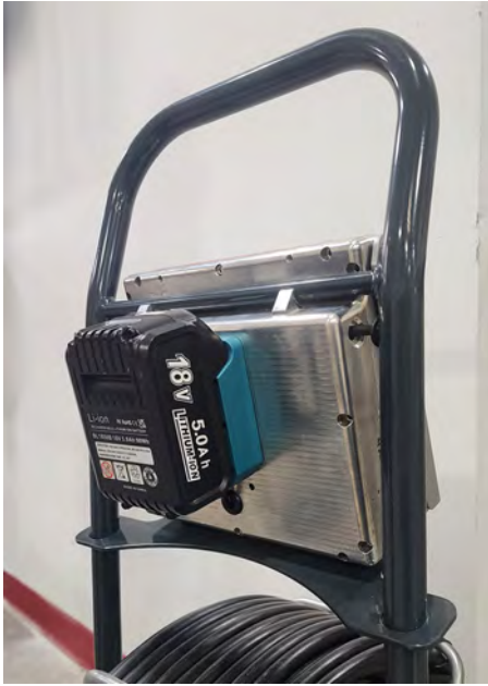
Makita with no adapter